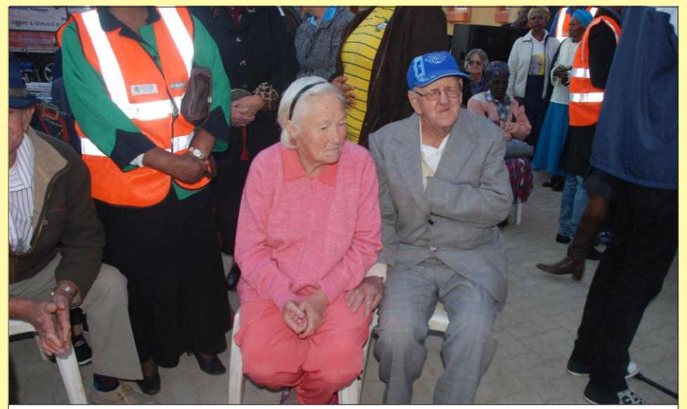
Ecstatic..... Some of the beneficiaries for the New Seshego Community Residential Units

areas are not looking to stay in a permanent home but are seeking rental a c c o m m o d a t i o n . "There is an increased demand for affordable and well located rental accommodation, where whites and poor share services" he said.