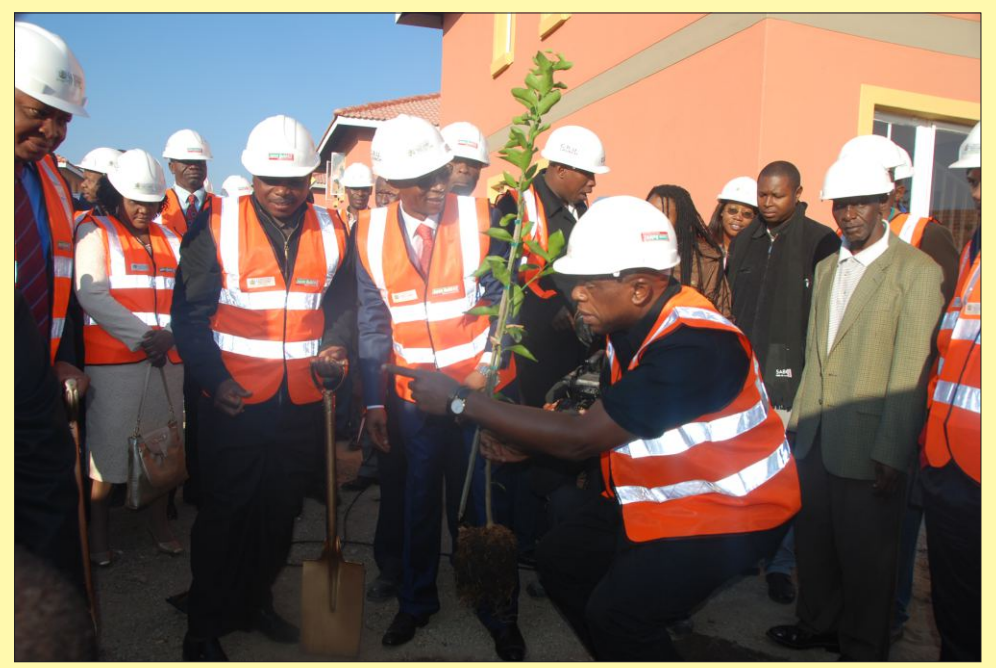
Greening .....Human Settlements Minister Tokyo Sexwale planting a tree during the launch of Seshego Community Residential Units

"People employed in this project were trained in various construction disciplines during the construction of 189 units"