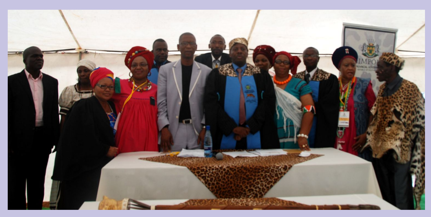
Traditional Leadership..... The newly Installed Capricorn House of Traditional Leaders