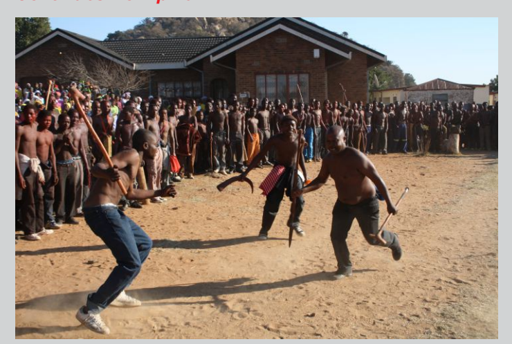
In celebratory mood.... Young men showcasing the beauty of being a graduate.

Spearheading..... MEC for Co-operative Governance, Human