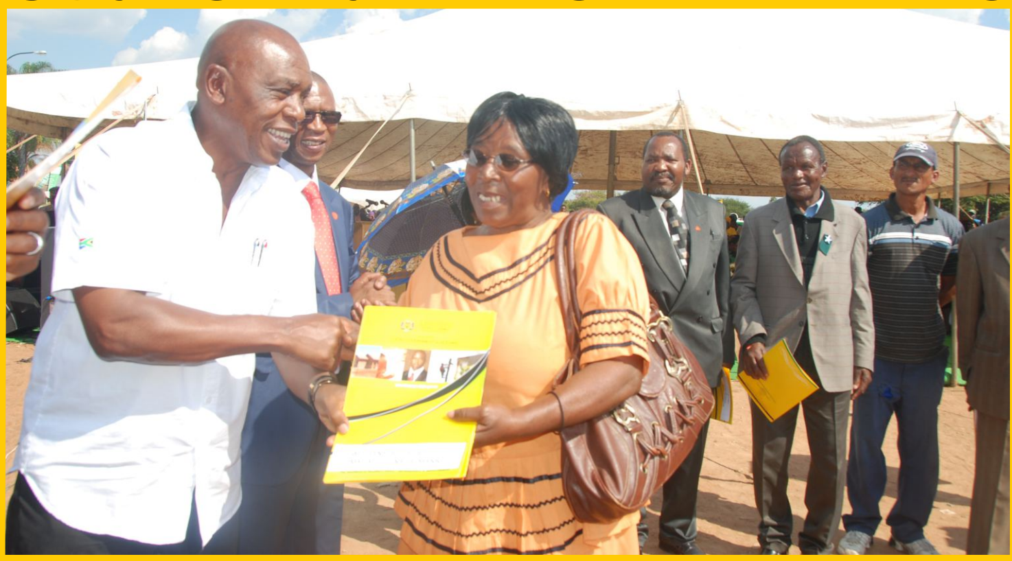
Granted.....Human Settlements Minister Tokyo Sexwale congratulating one of the recipients of the title deeds