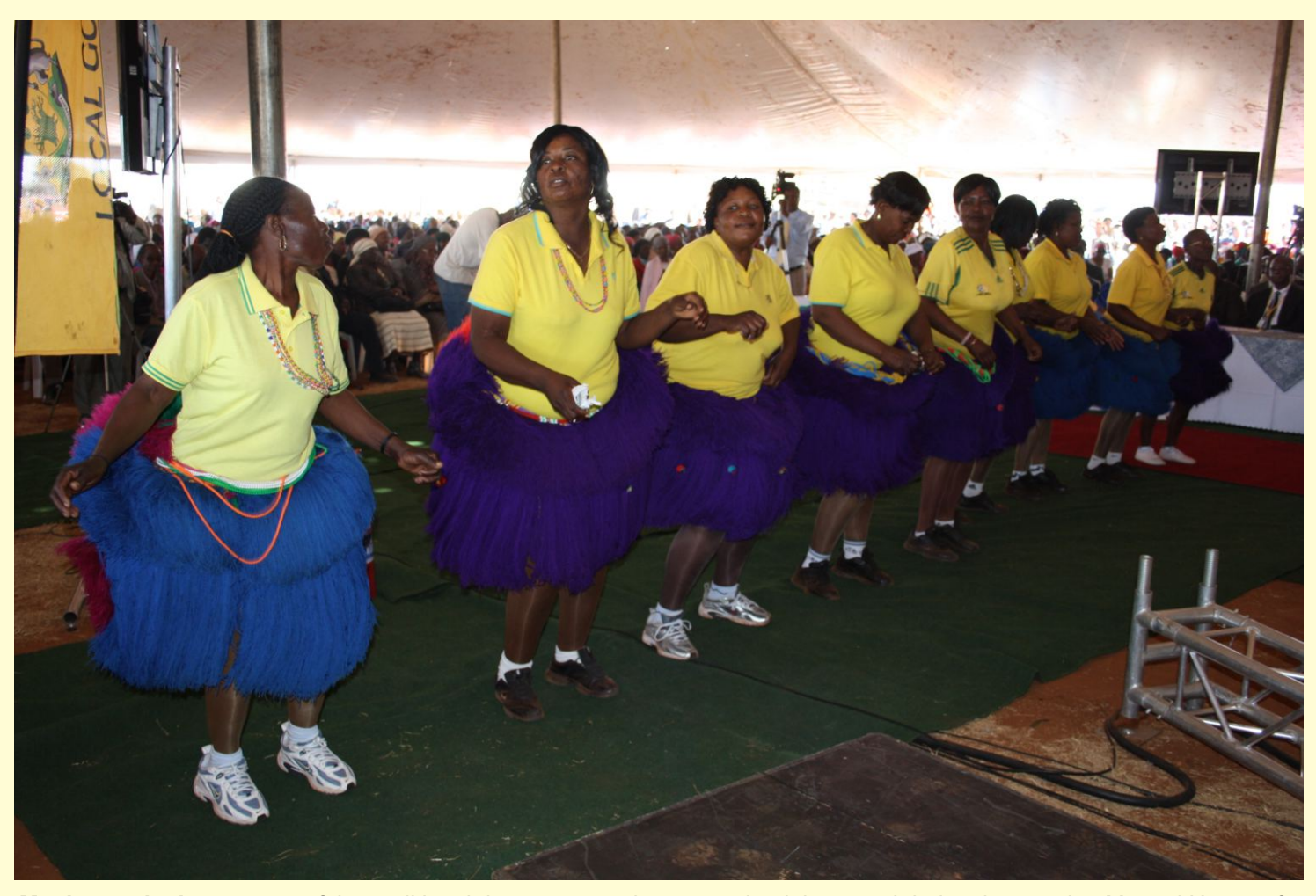
Moving to the beat .....one of the traditional dance groups that entertained the crowd during the opening Mopani House of Traditional Leaders