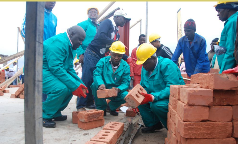
Brick laying...... MEC for Co-operative Governance, Human Settlements and Traditional Affairs, Soviet Lekganyane launching 2011 youth build at Mohodi

A team of 100 unskilled youth volunteers were recruited to participate in the building of 76 houses. The rationale of the move is to train these youth to acquire or to transfer construction skills which will assist them in future to build quality houses. The volunteers will meet timeframes and targets and thus assist in reducing the housing backlog. Young people acquire construction skills to increase their chances to access economic opportunities. This project will assist them to demonstrate leadership in their own lives and within their communities. During the Build, resources are mobilized to support the At the end, the programme. Department will acknowledge the volunteers by awarding them with