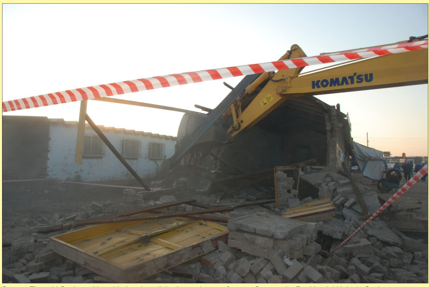
Gone....The old Seshego Hostel being demolished to make way for new Community Residential Units in Seshego