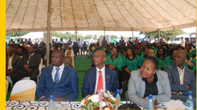
In Attendance....MEC for Co-operative Governance, Human Settlements and Traditional affairs, Soviet Lekganyane with Capricorn Executive Mayor, Lawrence Mapoulo

The Seshego CRU project is the first of its kind in the entire province at a cost of R40 million and will consist of 189 units. The unit caters lower income persons and households earning between R 800 and R 3 500 per month.